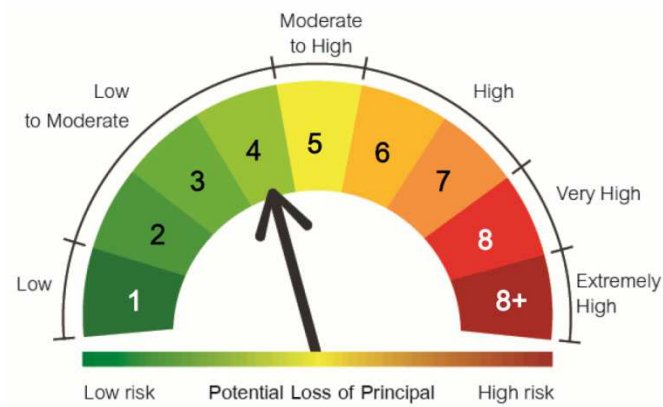
Risk Spectrum of the Fund